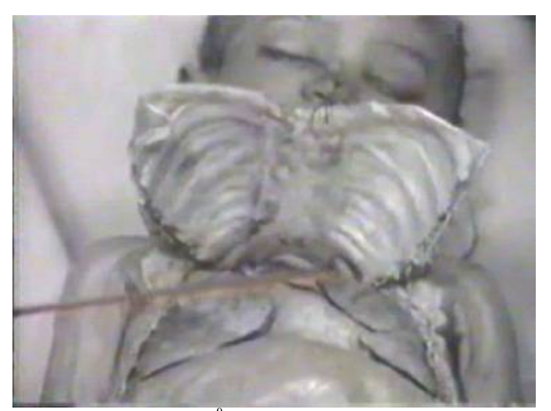
Image 1 – Analyzed frame<sup>9</sup> of the video "Heart: relationships and external morphology" (1977).

frontal framing<sup>6</sup>, directed from the feet to the head, slightly in plongée <sup>7</sup>, showing the superior third (thorax, shoulders and head) of the corpse of a child. A small baton interferes intermittently in the scene in consonance with a text uttered in voice-over<sup>8</sup>, either locating in the corpse the elements about which the narrator speaks, or just accompanying his expressive movements. It is possible to observe the movement of his shadow in the scene, and the uttered text is composed of seven short phrases that explain or justify what was done, locating the elements in the thorax.