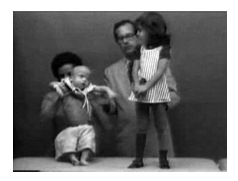
Image 5 – Frame of the same video, showing differences between children with and without congenital hypothyroidism. Text that accompanies the image: "The stature difference shows the importance of thyroid hormones for adequate growth".

This first edition uses the same pattern observed in the video "Heart: morphology and external relations": the text of the film is also composed of short and objective phrases, and visual resources – images of graphs and tables, live "models", radiological images – and demonstrations of examinations are employed to support or illustrate what is said.