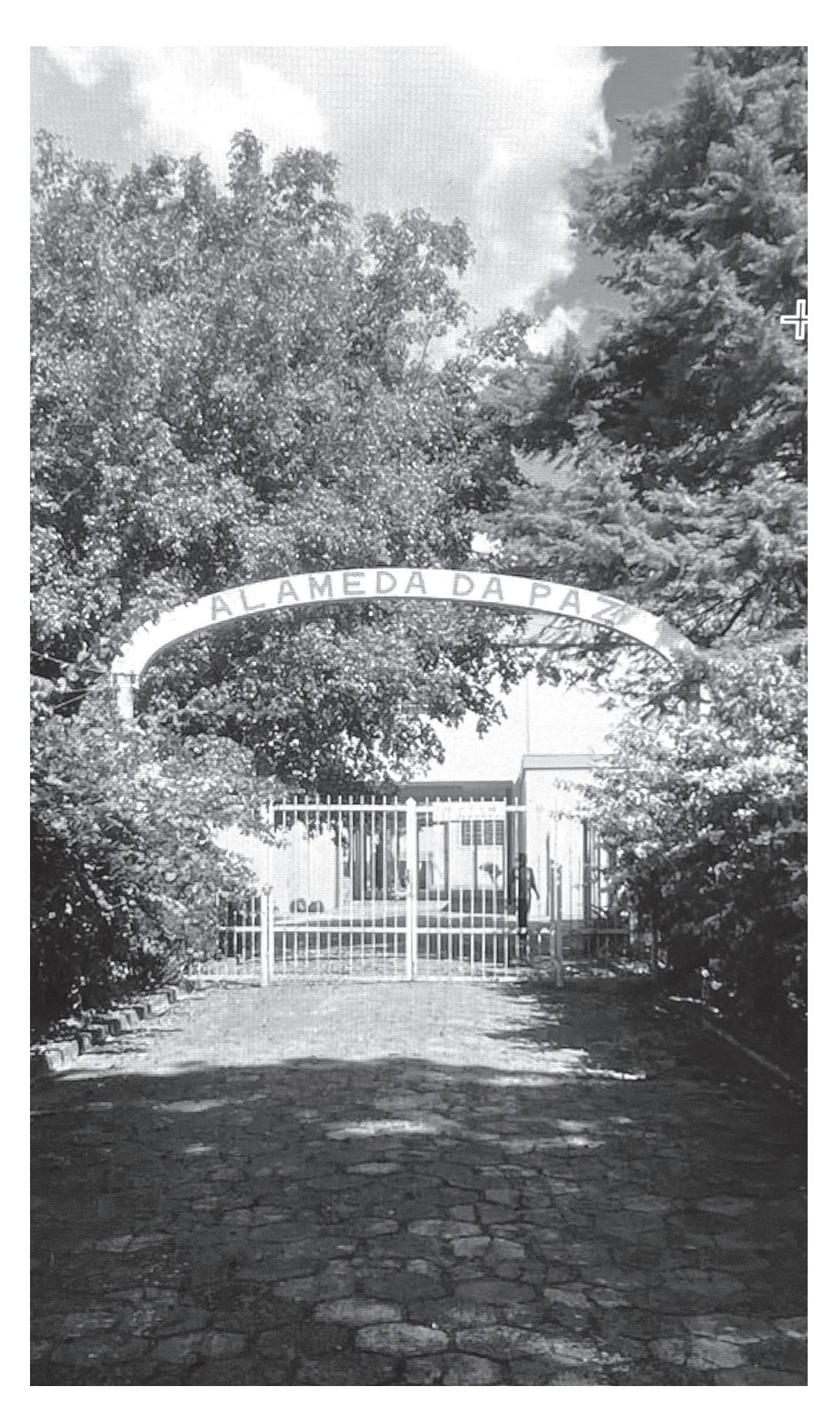
Figure 2. Peace