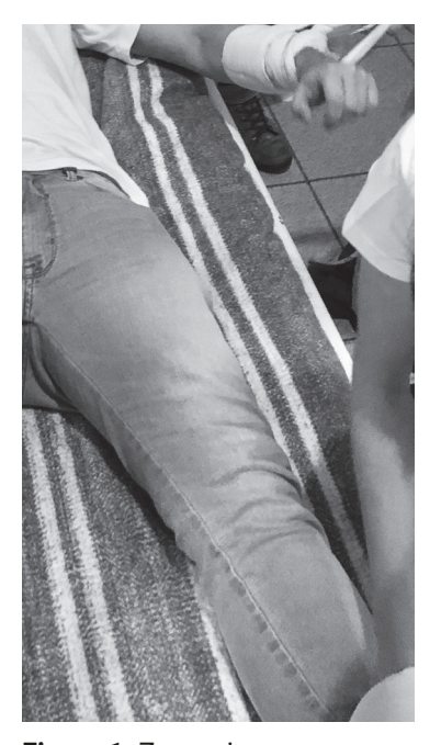
Figure 1. Zero privacy