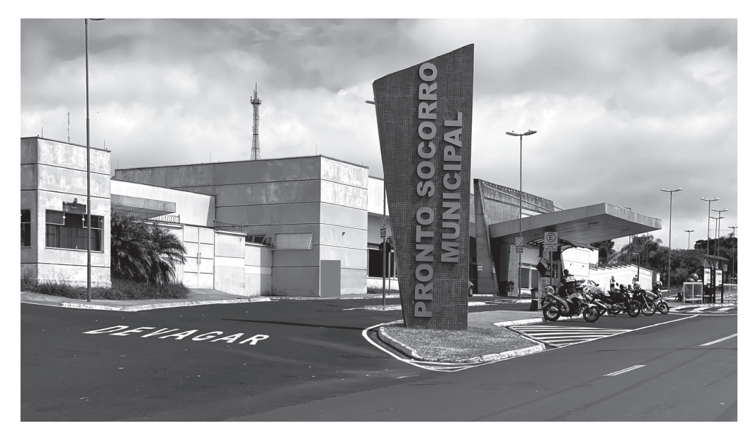
Figure 4: Emergencies