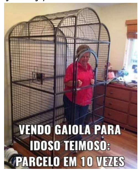
Figure 2 - Cage for older adults

The second example we bring is, again, based on the circulation of strategies to restrain this population since the decisions made by them are, in general, disregarded. In the following image, we see a woman inside a cage accompanied by the description "Cage for stubborn older adults for sale. Payment in 10 installments". The insertion of "for older adults" as a qualifying element of "cage" gives animal-like characteristics to "older adults", depriving them of human characteristics and, therefore, objectifying them. It is no wonder that Chauí states, in the presentation of the work Memory and Society, by Ecléa Bosi, that "in our society, to be old is to fight to continue being a man" (Chauí, 1994, p. 18).