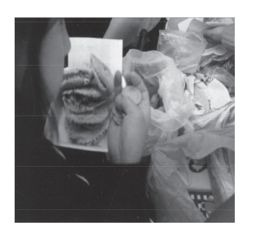
FIGURE I. PHOTO VOICE EXAMPLE