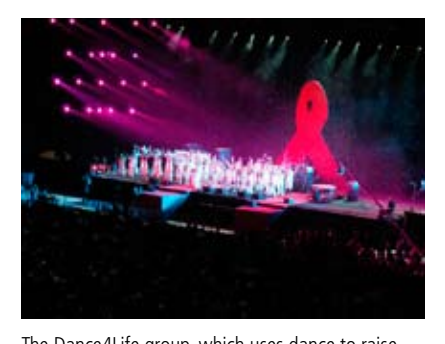
The Dance4Life group, which uses dance to raise AIDS awareness among young people, entertains the crowd during a special concert held on the opening day of the meeting.