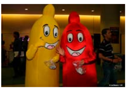
Prevention outreach workers in the conference hall.