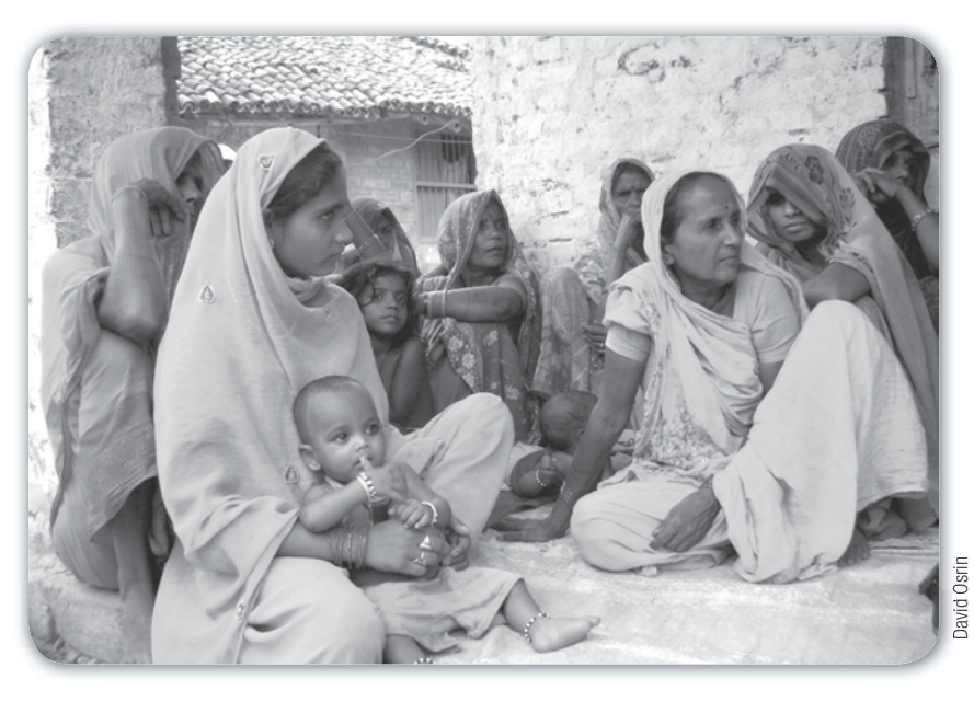
Fig. 1. A women's group in Dhanusha, Nepal

even if they have been shown to be efficacious in individual cases. <sup>22</sup> We will not discuss the issues of design, <sup>23</sup> analysis <sup>21,24,25</sup> and reporting of cluster RCTs, <sup>26–28</sup> but we think that researchers have an ethical responsibility to be aware of them, to seek advice and to report on the basis of appropriate analyses. <sup>27,29–31</sup>