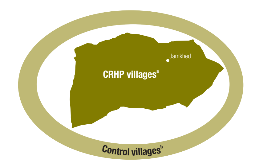
Fig. 1. Map of control and intervention areas in retrospective study of the impact of the Comprehensive Rural Health Project (CRHP), Maharashtra state, India

The sample size was calculated to attain 80% statistical power to detect a 25% reduction in under-5 mortality at the 5% significance level using a conventional 2-sided test. On the basis of data from the 1998–1999 National Family Health Survey for rural India, 25 we assumed a 10% under-5 mortality rate in the control villages and hence 7.5% under-5 mortality in the CRHP villages, with an intra-cluster correlation coefficient of 0.0175, estimated from the National Family Health Survey data for the period 1985–1995 for the 81 non-tribal rural