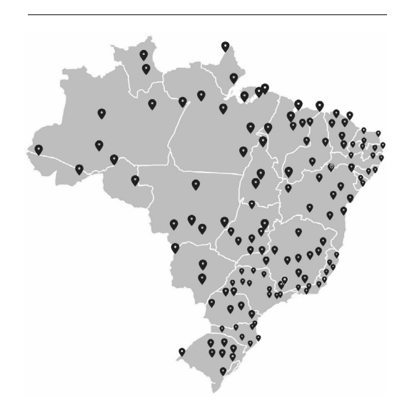
Figure 3. Location of the 133 sentinel cities included in the EPICOVID19 study.

The sample size, total and by municipality, was defined to balance precision of estimates and availability of tests. With the chosen sample size of 250 tests per city, we will have a precision,