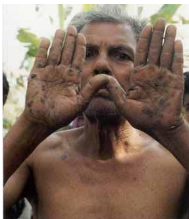
Fig. 2. A man from Rajapur showing the keratoses and spotted melanoses on his palms

School of Environmental Studies, Jadavpur University