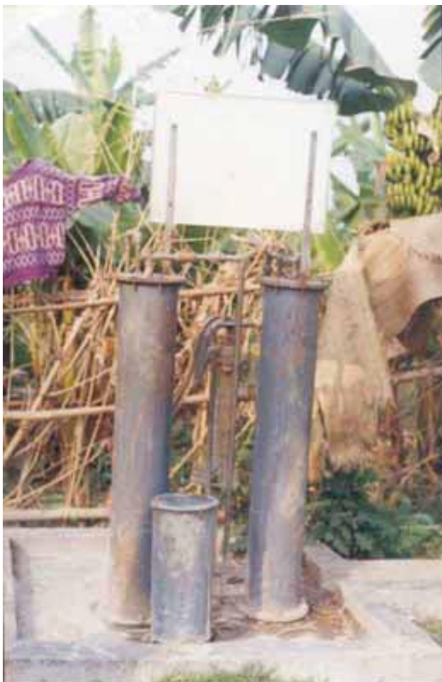
Fig. 3. An arsenic-filtering device that is no longer in use in Murshidabad

School of Environmental Studies, Jadavpur University