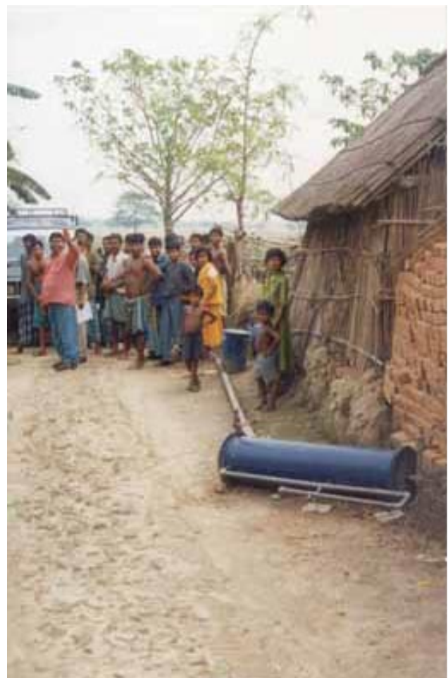
Fig. 4. Arsenic-filtering device that lay dismantled on a village road for 6 months

School of Environmental Studies, Jadavpur University