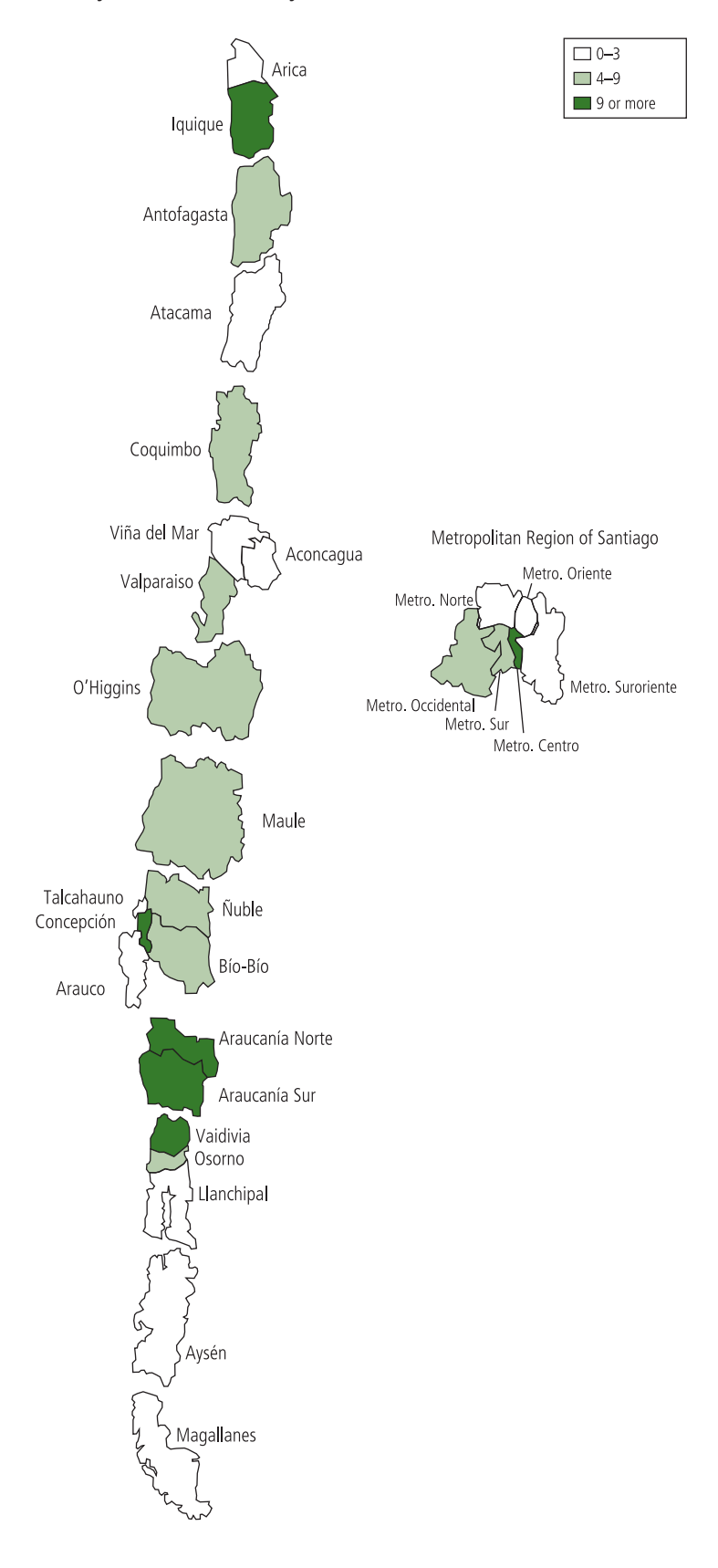
Fig. 3. Relative risk of infant mortality, no maternal education relative to 13 or more years of education, by health service in Chile, 2005