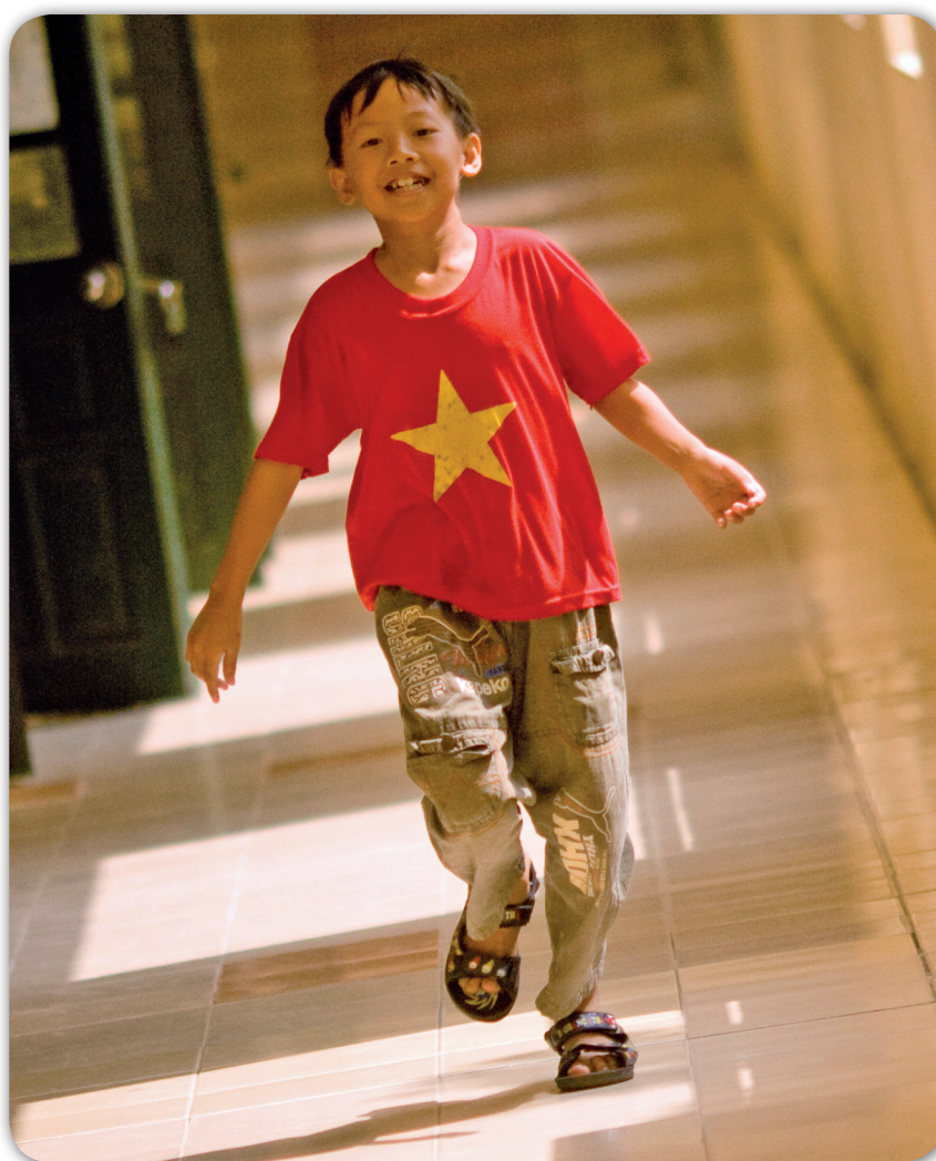
Pupil skipping along the corridor of his primary school in Hanoi, Viet Nam