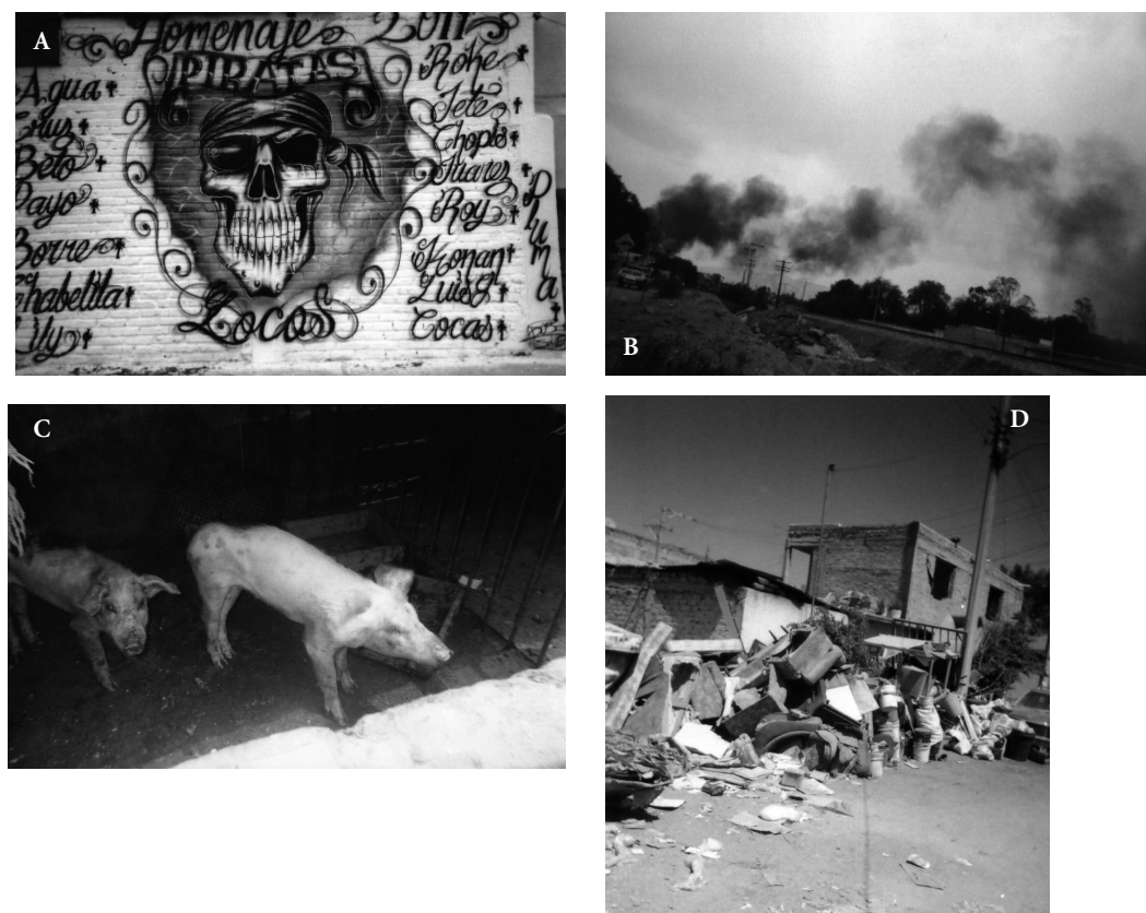
Figure 3. Examples of photographs of risks perceived by the students outside their homes (A) Vandalism in Morales (B) Air pollution due to the operation of brick-kilns in “Las Terceras” (C) Pigs kept by families in “Las Terceras” (D) Waste in the streets of “Las Terceras”.

rance among the residents. One student argued that people should get punished for throwing their waste on the street. Others indicated that people should make a basic contribution by saving water, polluting less and recycling. However, even though most of the respondents expressed that they would like to live in a clean environment, only very few mentioned how this could be achieved. In this sense, a local risk communication program could not only provide information on environmental health risks in the communities, but it could also provide alternatives while actively engaging the population in the process.