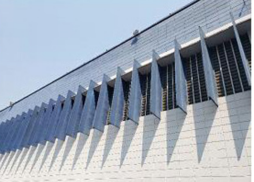
Figure 2. Fabiana's photo.