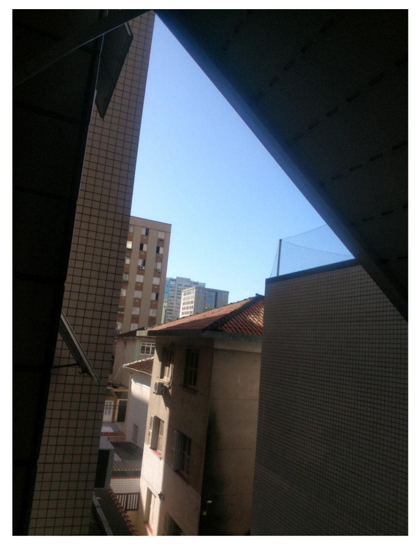
Figure 3. Ana's photo.