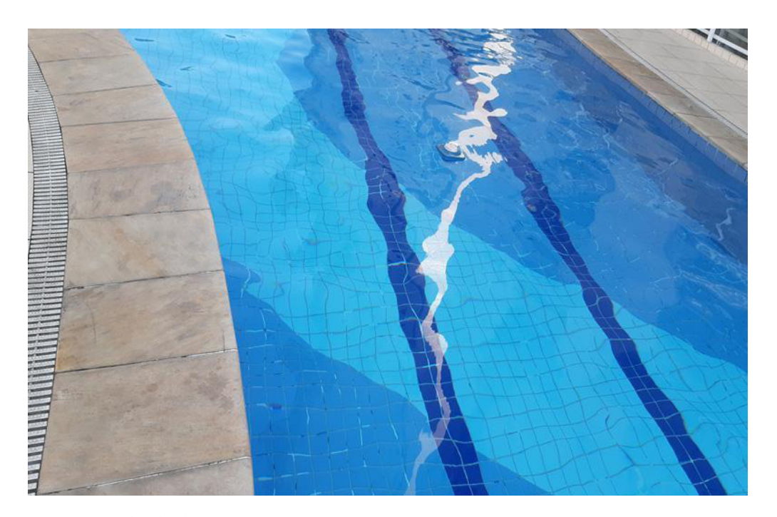
Figure 6. Andrea's photo.

Outside the class, exercises in observing colors, perspectives, textures and other rich details, make me realize the beauty of Sardinha's tail, realize the color of the slippers and stop to appreciate and admire, in simplicity, without pretending to be simple in fact, or complex. (Yasmin)