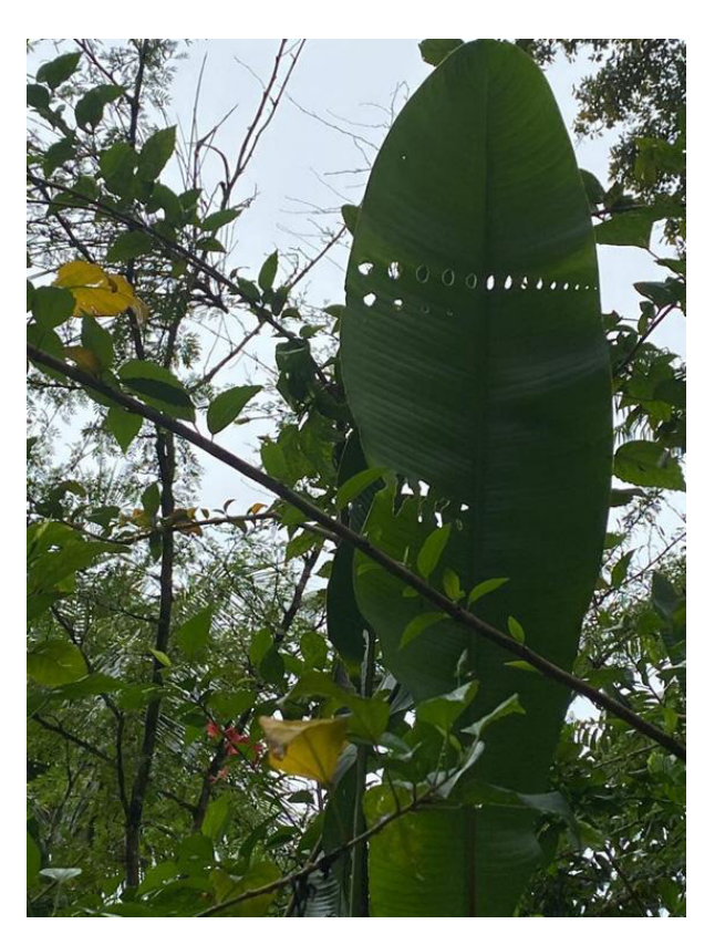
Figure 1. Juliana's photo.

And in one of the moments looking around, paying attention, I noticed a caterpillar's trace on the leaf that I nicknamed "The Virgo Caterpillar" because it seemed to have organized the way it ate the leaf. I thought it was beautiful and took a picture. (Juliana)