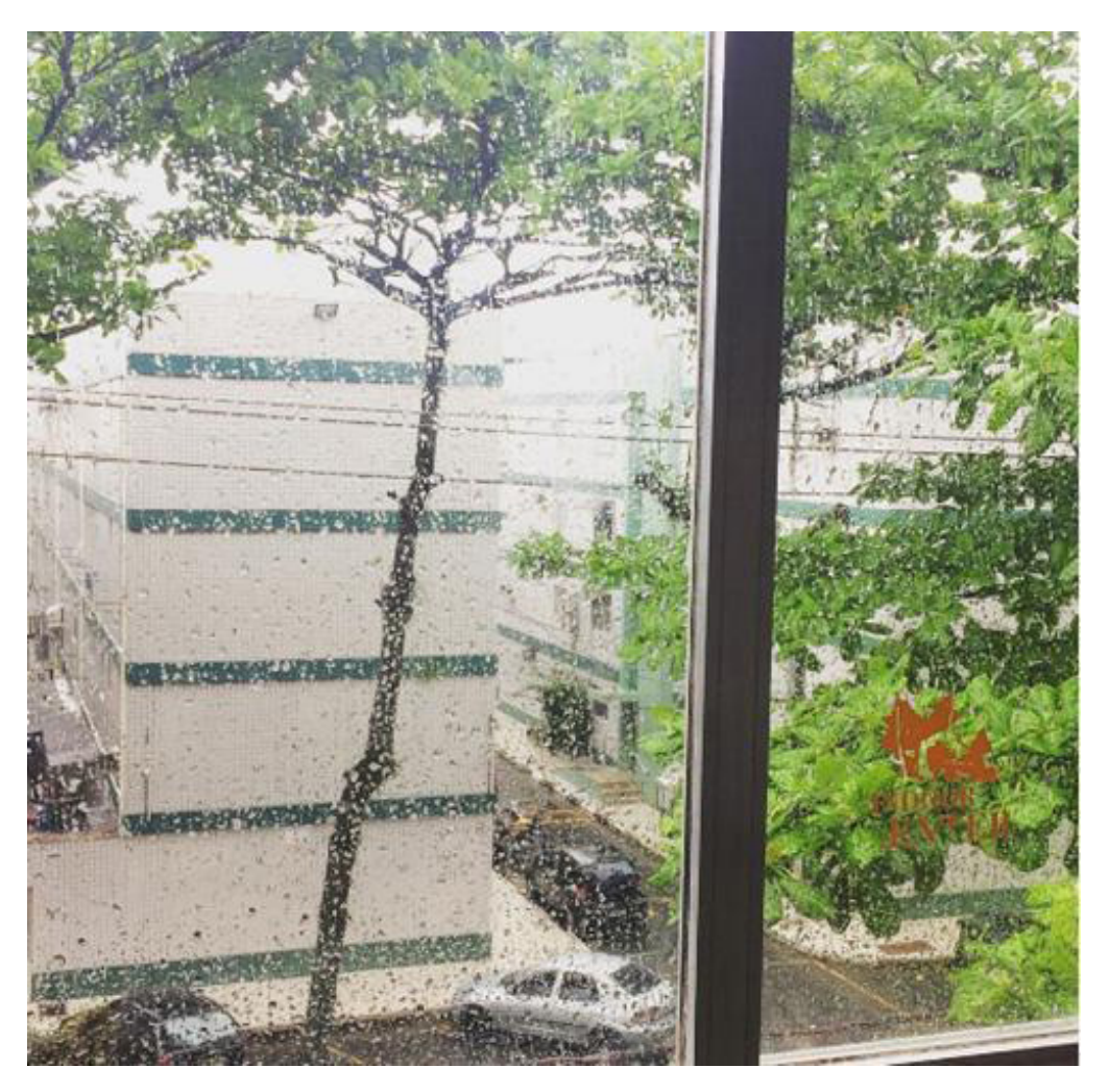
Figure 7. Evelyn's photo.

It was the first subject that I was going to take during the pandemic period and in 2020. [...] at first it distanced itself from the topic of the research project, but it called for the other areas of my life: yoga, meditation and health. (Evelyn)