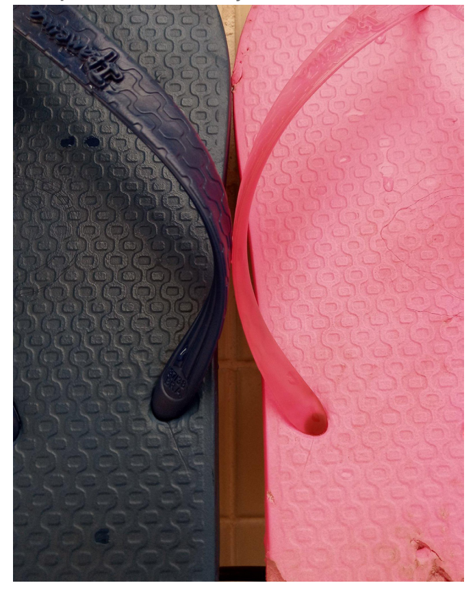
Figure 5. Yasmin's photo.