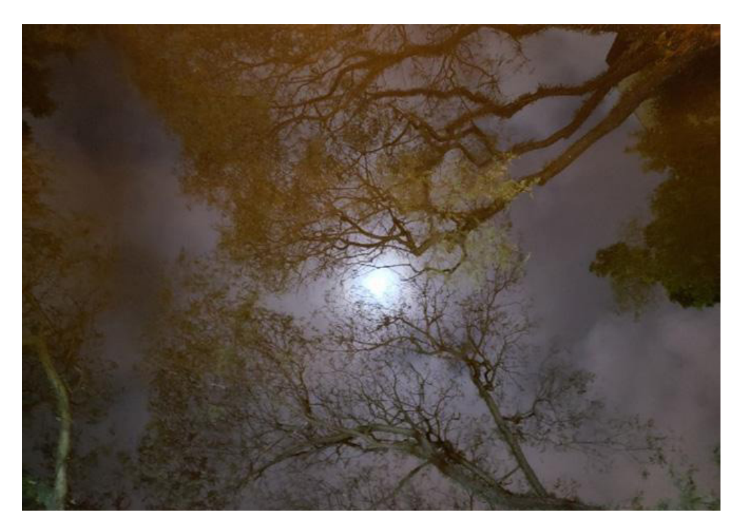
Figure 8. Fabiana's photo.

I define as a freshness to my soul and mind, have taken this course. (Fabiana)