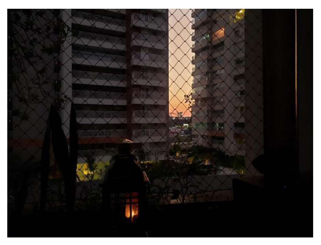
Figure 4. Fabiana's photo.

In my perception, the lack of clear guidelines from the moments that were supposed to bring them demonstrated an aspect as lethal as the virus. [...] Huge frustration befell me. [...] The validation of how much we can learn and teach in this movement of affective exchanges, the observation of the environment and what affects us without the frantic concern of making some citation or bibliographic reference is what is most precious about this experience. Our perceptions, experiences, feelings and desires exist. They exist in a place that the Academia denies and even rejects most of the time. (Ana)