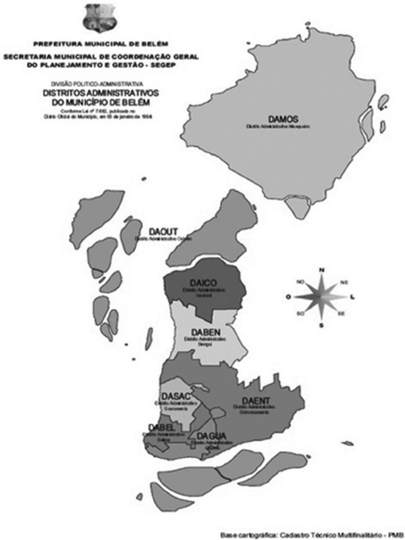
Figure 1. Map of Belém divided by administrative districts