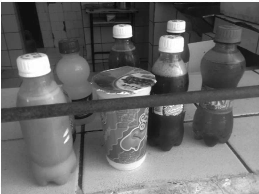
Figure 4. Drinks taken by the guardians of students from one of the surveyed schools