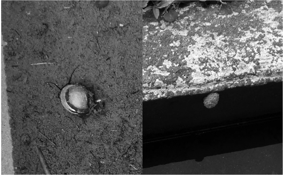
Figure 3. Gastropod mollusc (left) and eggs (right) found at school