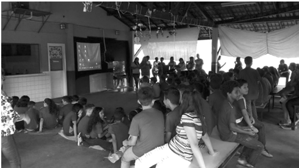
Figure 2. Health education action through lectures