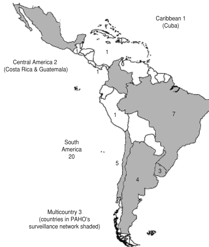
FIGURE 1. Distribution of studies used in burden of disease analysis, by sub-region and country

serotype coverage was higher for proposed vaccine formulations including 10 and 13 serotypes.