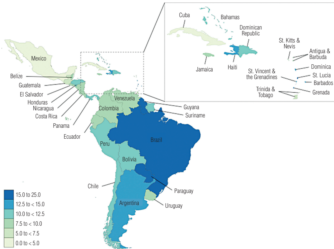
FIGURE 3. Prevalence of alcohol consumption during pregnancy among the general population of Latin America and the Caribbean, based on the two methods (meta-analyses versus weighted regression modelling/data prediction), 2012

Note: Prediction of the prevalence of alcohol consumption during pregnancy for Argentina was not possible due to missing data.