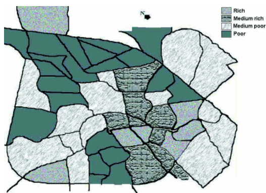
Figure 1 - The distribution of geoeconomic areas in Ribeirão Preto, Brazil, according to the income of the head of the family.

Total infant mortality rate and its components were negatively related to the geoeconomic classification, with the poor section showing the highest rates and the rich section the lowest (Table 3). The post-