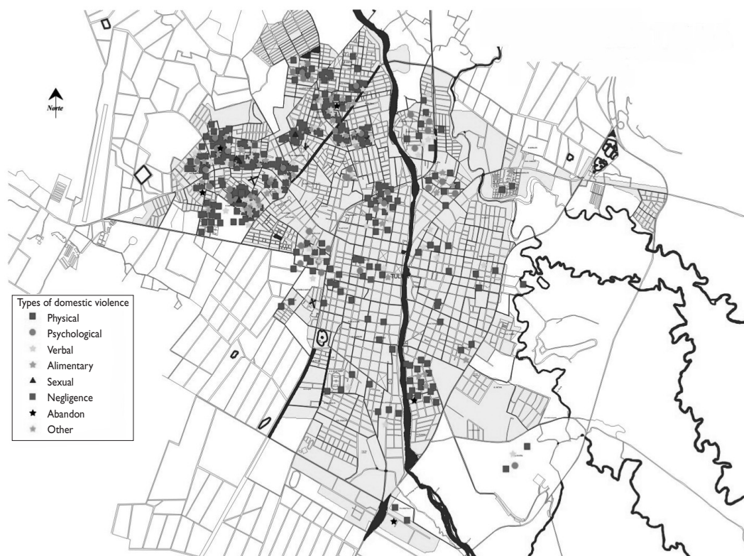
FIGURE 2. TULUÁ, LOCATING CASES OF DOMESTIC VIOLENCE. 2004

As a result of the project, all the observatories currently use geo-referenced systems that allow them to locate and intervene in cases of violence. For example, during the implementation of the observatories, the number of reports of domestic violence increased in Tuluá, as shown by the maps identifying cases. This mapping proved to be one of the most useful tools in our work (figure 2). In Tuluá, as a result of the mapping, local authorities created new centers for the attention of those affected by domestic violence, including extended hours of attention up to 24 hours and during weekends.